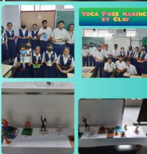
YOGA POSE MAKING BY CLAY