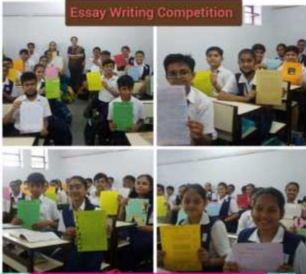
Essay Writing Competition