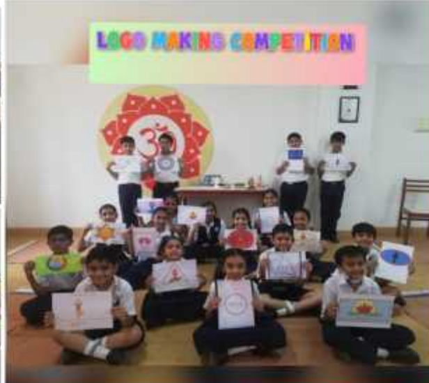
LOGO MAKING COMPETITION